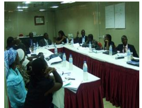
Cross-section of participants at the training