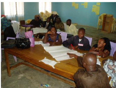
Participants at one of the refresher trainings

● YARAC: Enhancing the capacity of teachers and school administrators to implement the FLHE curriculum: In an effort to continue to improve and ensure access to and quality